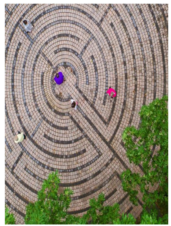
Escape for a relaxing weekend to tranquil Bon Secours Retreat & Conference center!

Escape for a weekend of rejuvenation, relaxation, and renewal at the serene Bon Secours Retreat & Conference Center. Set amidst 300 acres of lush woodlands, this Iyengar Yoga retreat offers the perfect blend of nature, comfort, and transformative yoga practice. Beginning Friday afternoon and concluding Sunday afternoon, the retreat invites you to deepen your yoga journey while enjoying the beautiful facilities and nourishing meals offered by Bon Secours.